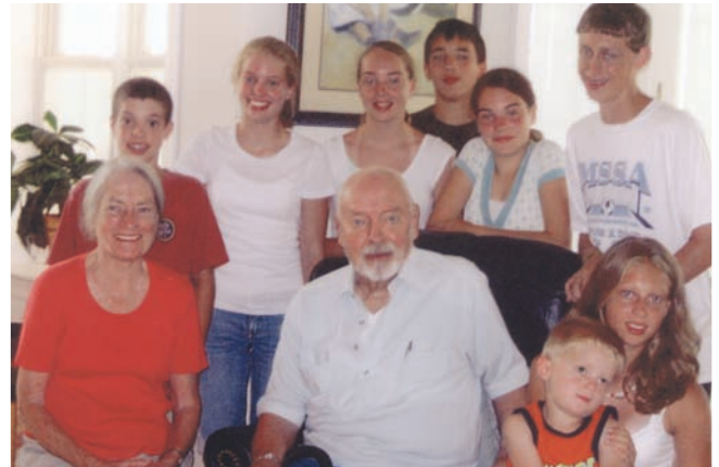
The Smarts with eight of their nine grandchildren