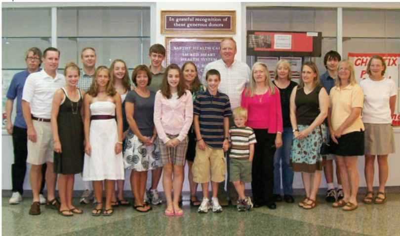
The Smart family toured the cutting edge Mary Ekdahl Smart Center for Patient Simulation & Research in July